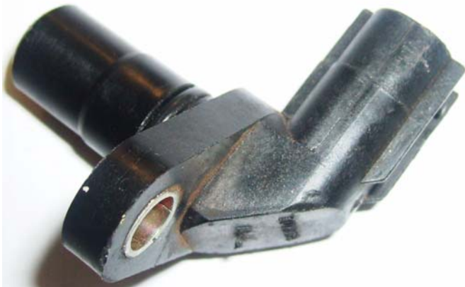
Magnetic Type Speed Sensor