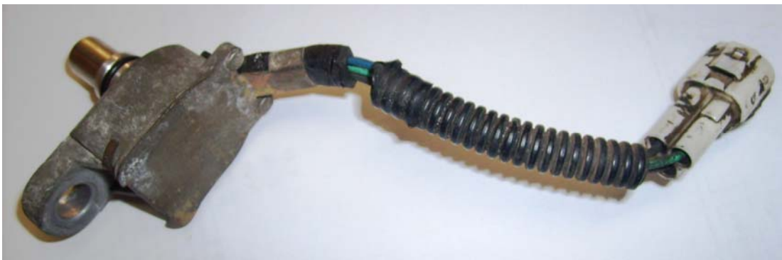
Hall Type Speed Sensor

In Auto Mode the AGC will shift down to 1 st gear when the road speed falls under a pre set speed and if the throttle position is below 10%. On a down hill it will shift to 2 nd gear if the road speed is above twice the pre set speed and if the throttle position is below 10%. This will ensure an even pull-off when the throttle is pressed again.